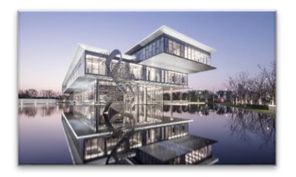
Hangzhou Central Mansion