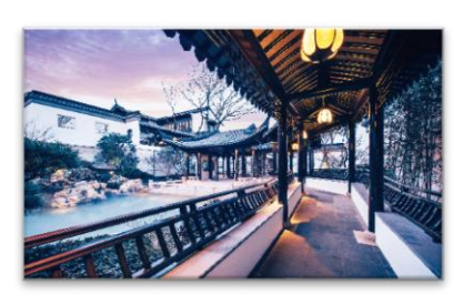
Nanjing Fairy Land